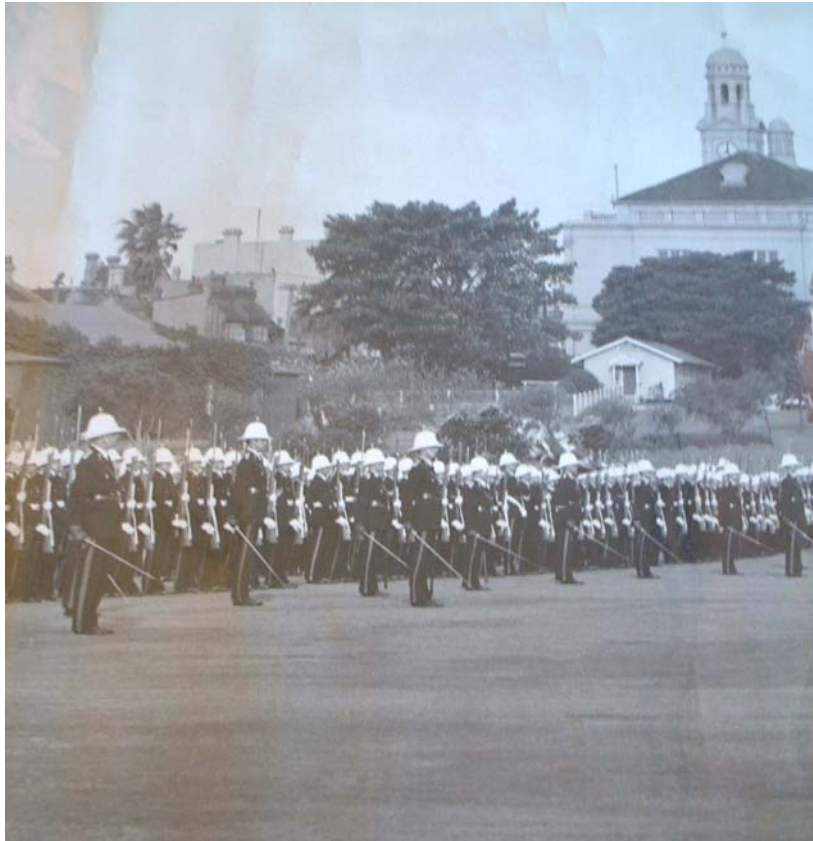
Precinct 8 – undated