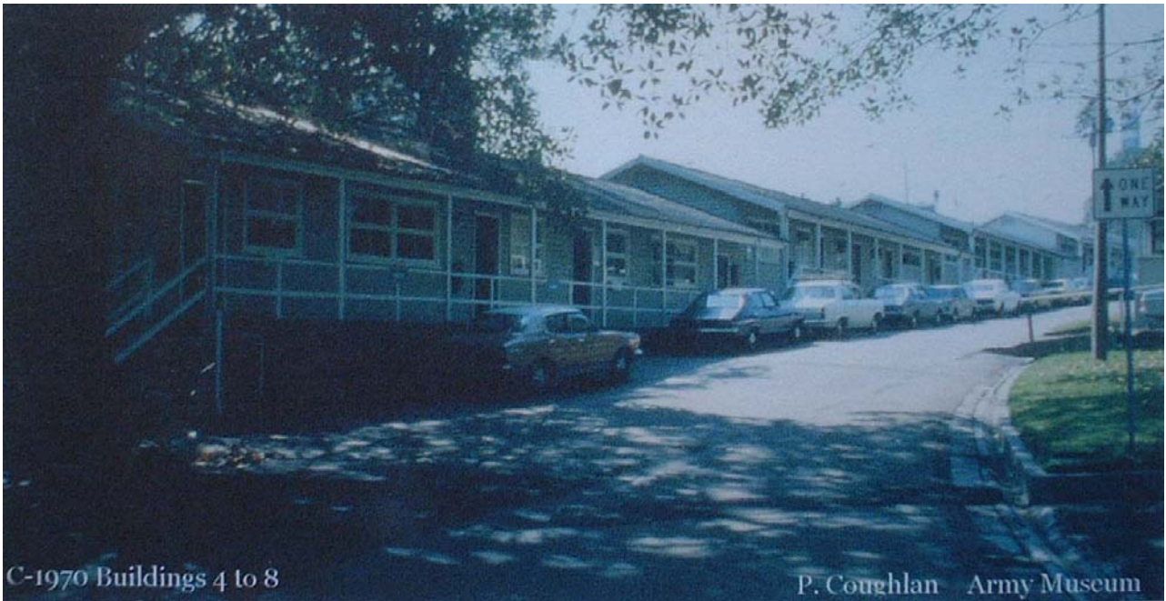
C-1970 Buildings 4 to 8