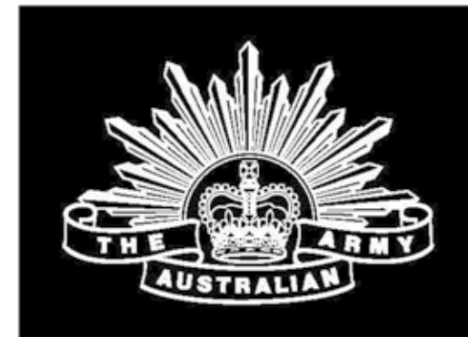
Full-colour, line and reverse-line versions of the Rising Sun badge