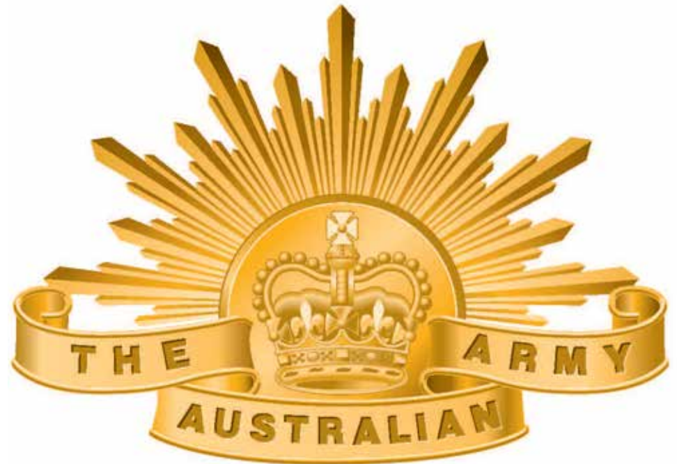
Rising Sun badge

Contact the Army Brand Manager for permission to use the Rising Sun badge.