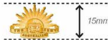
Rising Sun badge minimum size

Clear space is the specified minimum area around the Rising Sun badge that must remain clear of any graphic elements or type. The formula for calculating the minimum clear space is the 'X height'. To the right is the formula for calculating the minimum clear space for the Rising Sun badge at any size. The X height is the distance between the bottom and top height of the top scroll.