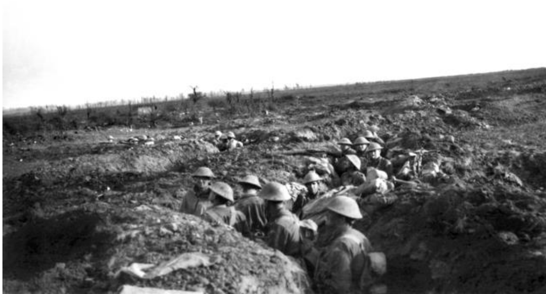
Members of the 24th Battalion in trenches near 'Flinte Farm' beyond the crest of Broodseinde Ridge, looking down on the woods (in the middle distance) to which the Germans had been driven.

The Anzacs captured all their objectives on the Ridge. The Battle accounted for around 20,000 British casualties, 20 which included around 6,500 Australians and around 1,700 New Zealanders. 21 The British Army were successful along the entire line, which gave them their first clear view north to the Flemish lowlands since May 1915. 22