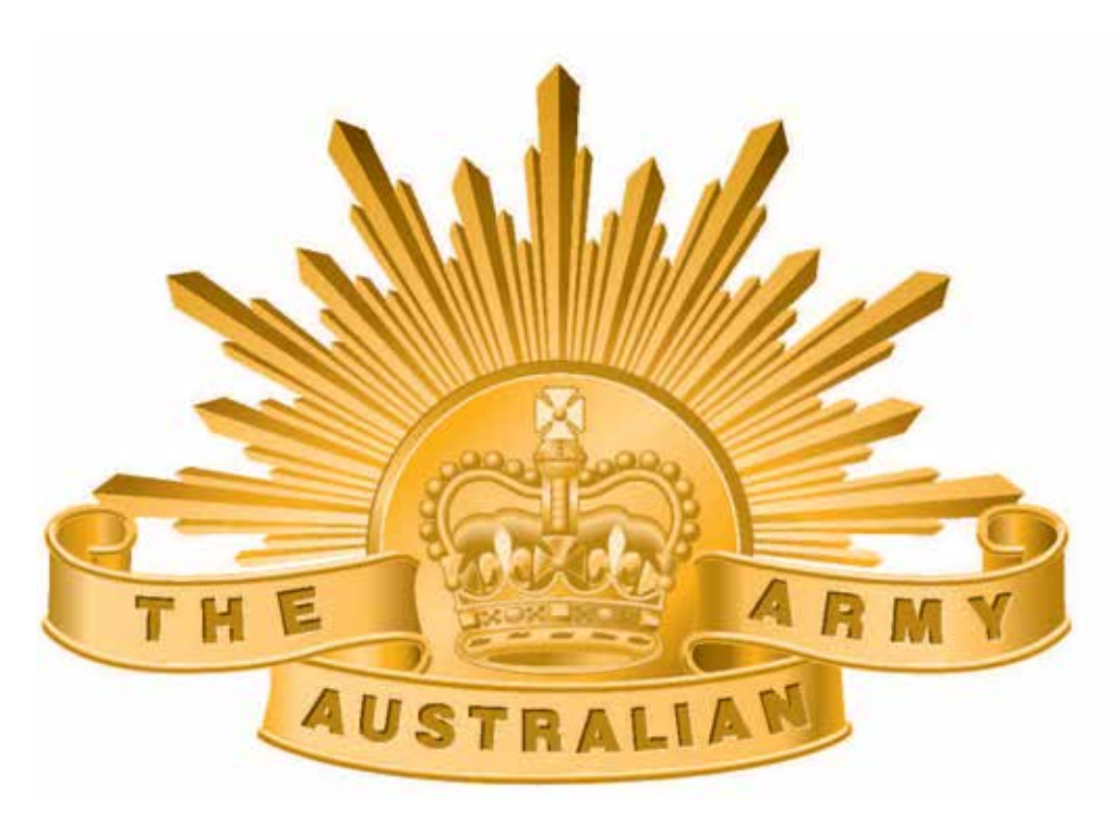
Rising Sun badge

Contact the Army Brand Manager for permission to use the Rising Sunbadge.